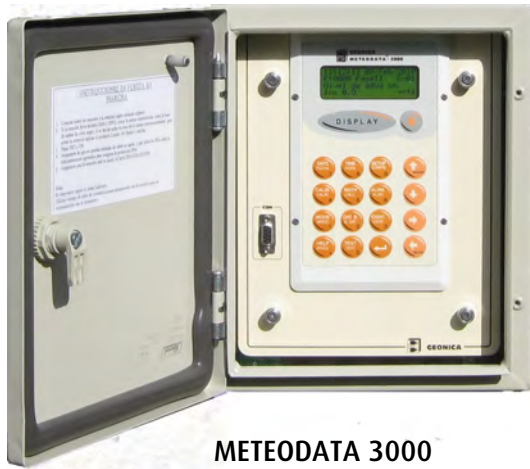
METEODATA 3000 Datalogger with integrated comms (3G/GPRS, Line, Radio or Satellite)