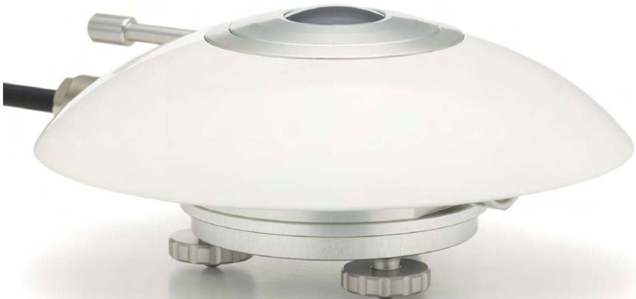
Figure 1 GEO-IR20 research grade pyrgeometer

GEO-IR20 is a research grade pyrgeometer suitable for high-accuracy longwave irradiance measurement in meteorological applications. Thanks to technological innovation, GEO-IR20 is offered at a significantly lower price level than competing models of the same performance level. GEO-IR20 is capable of measuring during both day and night. In absence of solar radiation, model GEO-IR20WS offers even better accuracy because of its wider spectral range.